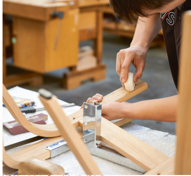
VS Vereinigte Spezialmöbelfabriken produces high-quality contract furniture for schools and offices.