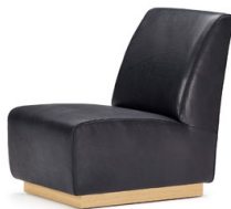
Featuring a timeless design with clear lines and compact dimensions: "Slipper Chair".