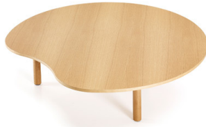
The "Low Organic Table" combines soft lines and organic shapes.