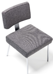
Dynamic and elegant – the "Tremain Side Chair Steel" is the epitome of "Martini Modernism".