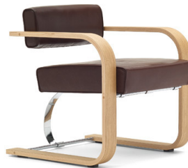
Another version of „Cantilever Chair“: Plywood with oak veneer combined with natural nappa leather.