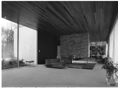
Neutra is famous for his spacious, light-infused rooms.