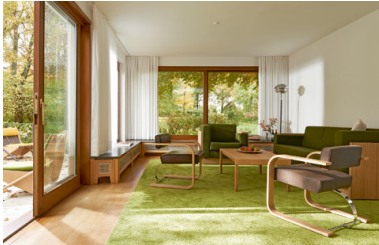
The Neutra Collection is ideally suited for not only private homes but also for offices, lounges, lobbies and hotels.