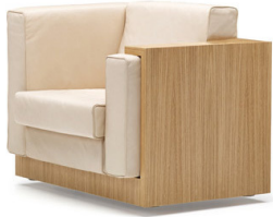
Conceived as fitted furniture, the items in the "Alpha Seating" range also work well as standalones.