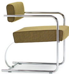
The design of the "Cantilever Chair" deviates from its classic predecessors of the 1930s. The seat is separate from the backrest.