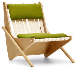
Its curving sides and tensioned belts have turned the "Boomerang Chair" from the 1940s into a design icon.