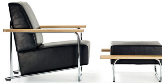
The "Lovell Easy Chair" is now being produced by manufacturer VS.