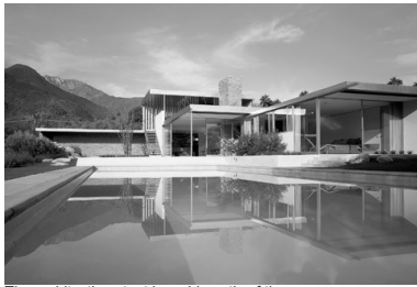
The architect's output is emblematic of the "International Style" – his buildings forge a link between European and American Modernism.